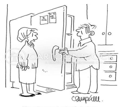
"I'm going on a Lenten fast, dear, and I'm taking you with me."