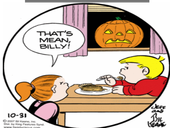
"You shouldn't eat pumpkin pie near a jack-o'-lantern!"