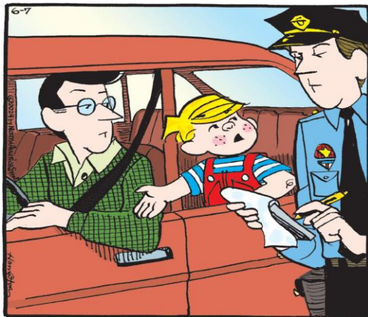
"HE REALLY DIDN'T RUN THE STOP SIGN... 'CAUSE HE WAS ACTUALLY SITTING DOWN!"